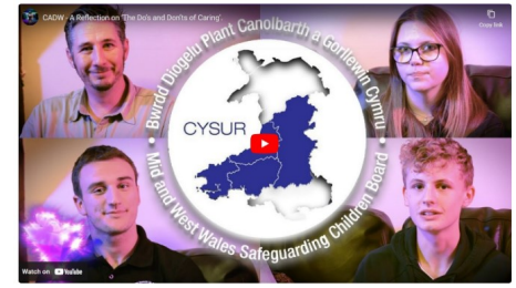
Junior Board's Safeguarding Resources